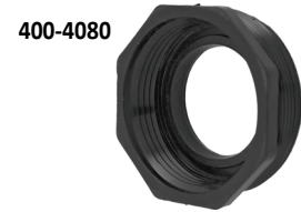
400-4080 Converts 1.5" Standard Union Thread to Larger Hayward Union Thread