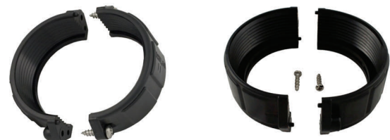
Small Inner Flange Fits Pump Union Tailpieces