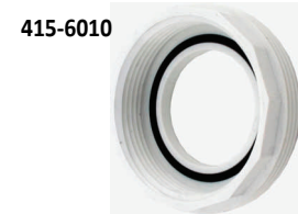
415-6010 Converts 2" Pump Inlet or Outlet to 2.5" Fits Waterway, Aqua-Flo & Others