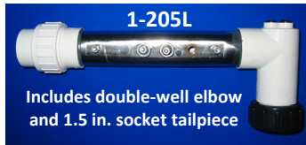
Includes double-well elbow and 1.5 in. socket tailpiece