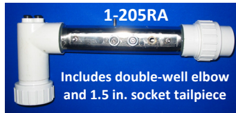
Includes double-well elbow and 1.5 in. socket tailpiece